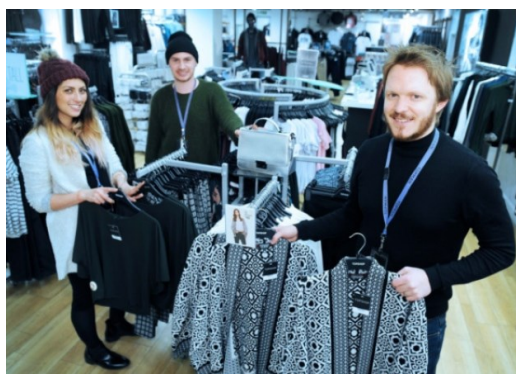
Retail staff who are asked to wear the company's own clothes can not claim a tax deduction for those clothes.

If you're unsure about the tax deductibility of your work related clothing, we invite you to contact us to discuss the rules and regulations.